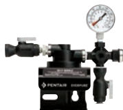
QC7I SINGLE HEAD (EV9272-41)