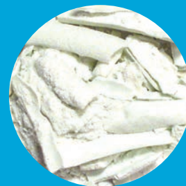
CALCIUM AND MAGNESIUM LIMESCALE DEPOSITS