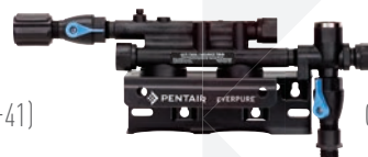
QC7I TWIN HEAD (EV9272-22)