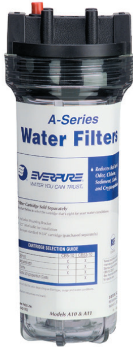
A-10 10" Clear Housing: EV9100-01